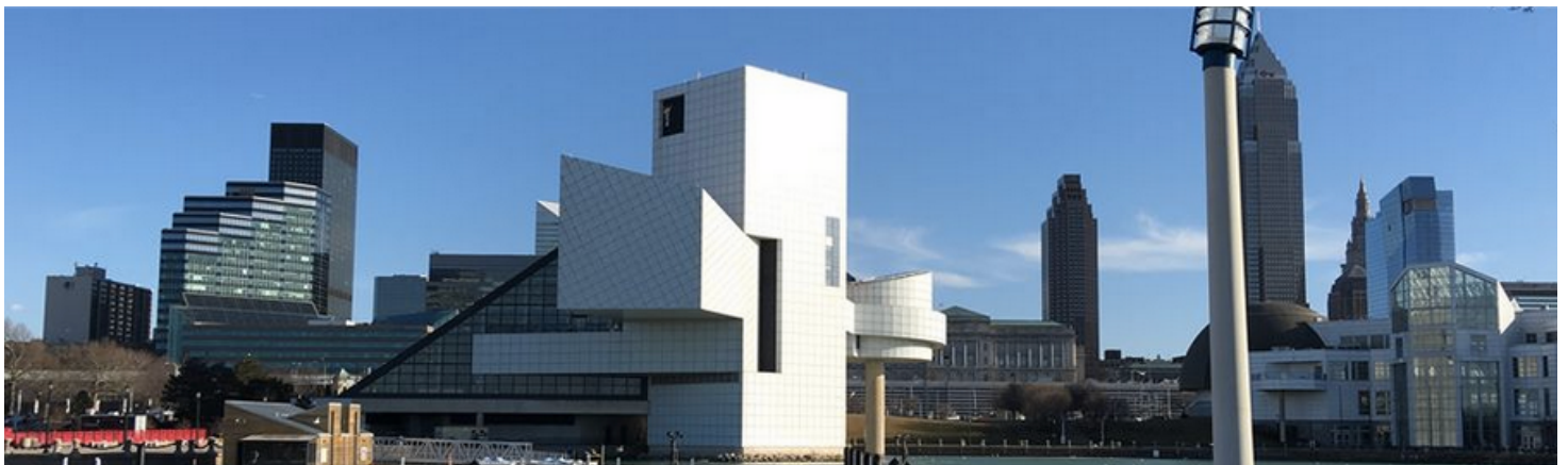
This view of downtown Cleveland’s lakefront includes the Rock N Roll Hall of Fame and Museum (center), a popular destination for anyone in search of arts programming in the city.