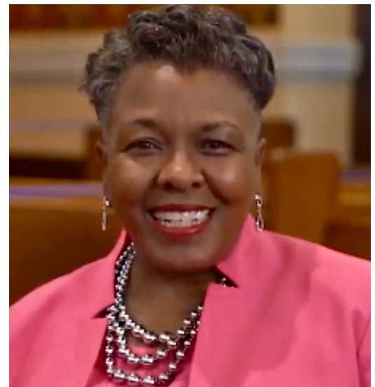
(Above, left to right)

The flags of the church, Black America, and the United States of America are displayed in the sanctuary of St. Adalbert / Our Lady of the Blessed Sacrament Roman Catholic Church.